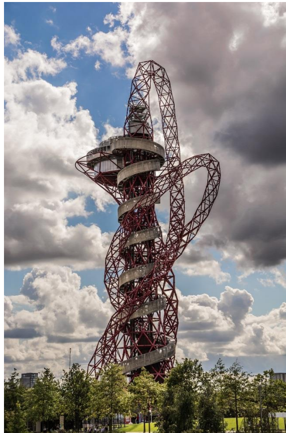
Figure 1.1 – ArcelorMittal Orbit, Queen Elizabeth Olympic Park

The ArcelorMittal Orbit (refer to Figure 1) was a landmark of the London 2012 Queen Elizabeth Olympic Park. Since the games, its legacy has continued, with it now being used as an observation tower, the world's longest and tallest tunnel slide and the UK's highest freefall abseil.